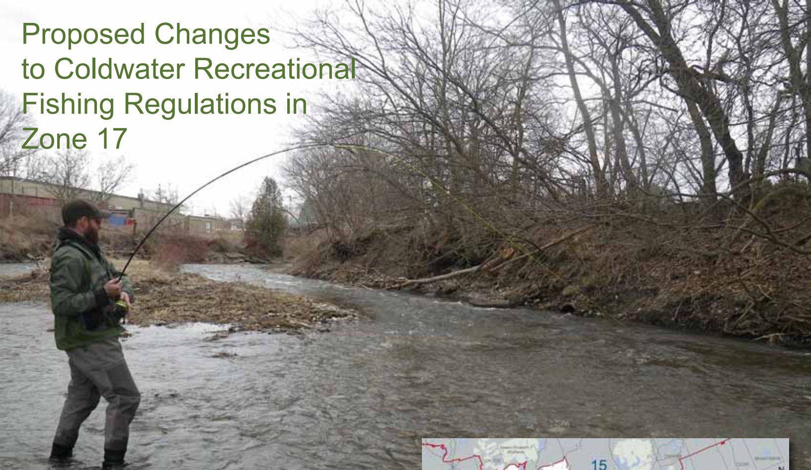
Fly fishing for trout in Cobourg Creek